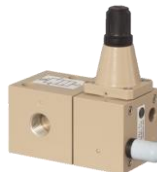
Pneumatic Lock-up Valve