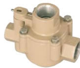
Quick Exhaust Valve