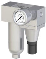
Supply Pressure Regulator