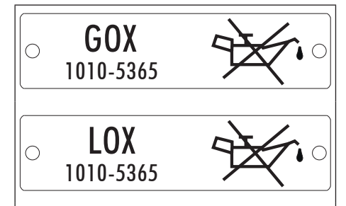
Fig. 1: Labels for gaseous oxygen (GOX) and liquid oxygen (LOX)

If a certain pressure and temperature have been specified in the order, the device is marked with a label for oxygen service which includes these specifications (see Fig. 2).