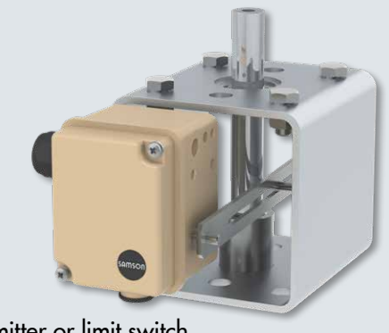
Position transmitter or limit switch for plant monitoring