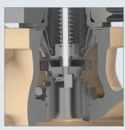
Special plug stem guiding for use in vertical pipelines