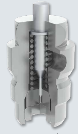
Micro trims to regulate even the smallest flow rates