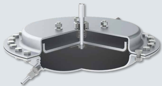
Actuator with leakage line connection for critical media