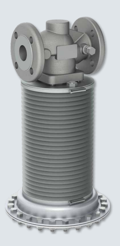
Protective sleeves, e.g. against dust, erosion during sandstorms or against corrosion in offshore service